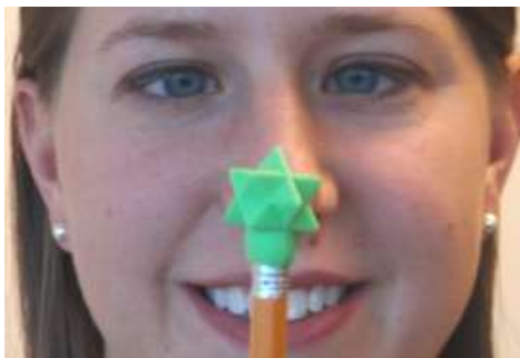
Figure C - To the Nose