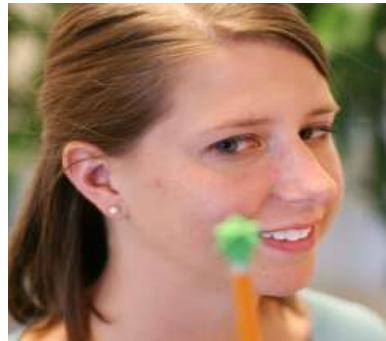
Figure B - Right Gaze