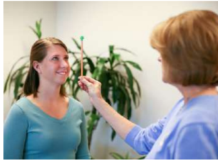
Figure A - Set up