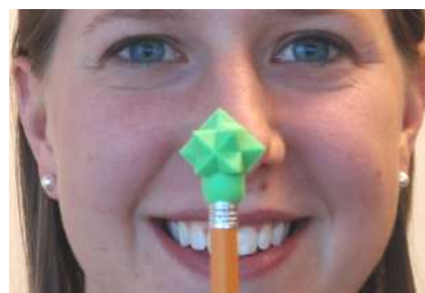
Figure D - Losing fixation